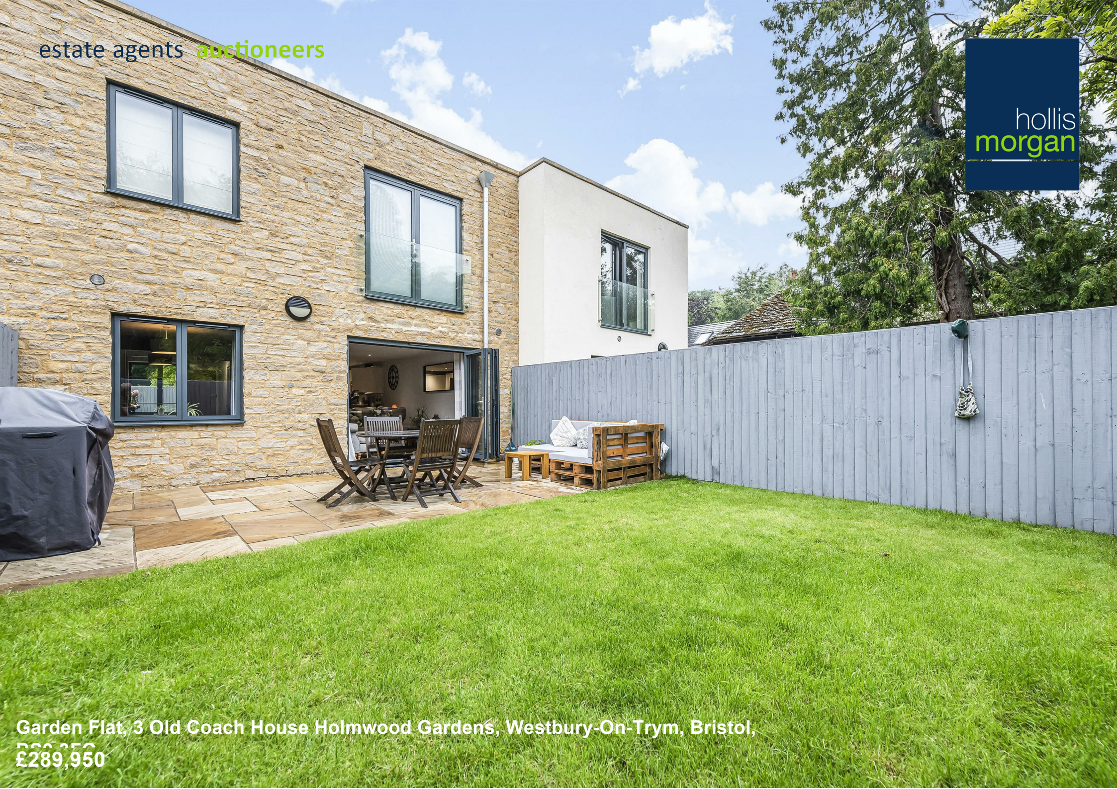
Garden Flat, 3 Old Coach House Holmwood Gardens, Westbury-On-Trym, Bristol, £289,950